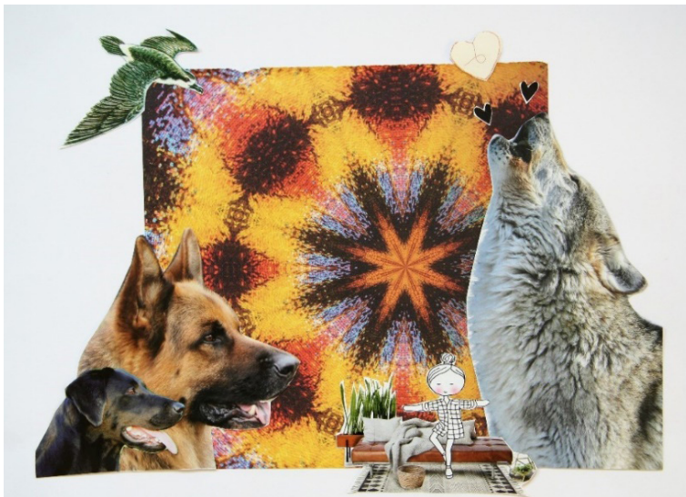
Figure 5 Art works reflecting issues of people moving from protected living to the neighbourhood

A butterfly on the background A kaleidoscopic picture She meditates; pictures in the head The wolf is scary! Or related to the dogs that provide safety? Are the dogs safe? Two dogs at the same time is problematic The wolf weeps love