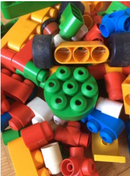
Figure 4 Mess with creative potential

As Reason (1998: 154) suggests, ‘the clarity of the present and the as-yet undefined possibilities of the future, [provide] a gap which stimulates the imaginative capacities of the participants’. It is the space for new ideas, the space where, as this man (from a former project) described, you can let your ‘mind slip’: