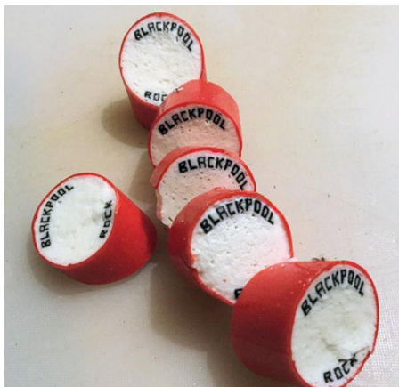
Figure 1 Letters through a stick of Blackpool Rock

What is valued in PR is not only what is already known, but how that which is already known can be developed to make socially just changes. These changes are based on knowledge generated from the participatory endeavours of communities of practice. Communities of practice are social learning systems that engage in activities, conversations and reflections. They produce physical and conceptual artefacts such as words, tools, concepts, methods, stories and documents that reflect the shared experience (Wenger, no date). These communicative spaces for learning draw on Habermas' notion places for '... mutual recognition, reciprocal perspective taking, a shared willingness to consider one's own conditions through the eyes of the stranger, and to learn from one another' (2003: 291). The value of each person's contribution can be seen in the co-creation of the research process, the generation of data, and the approach to making meaning of the data we generate (analysis). How we understand what is important for communities of practice and wider society, the actions, changes (impact) that arise from the research process, and what messages are disseminated beyond the research, is based on these principle of participation.