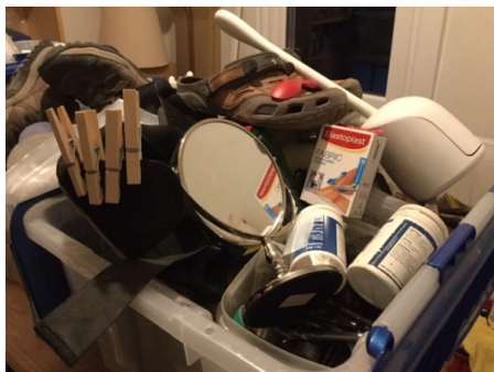
Figure 2 General mess

Nor is it the same mess, shown in Image 3 below, when all the elements are predetermined, just muddled, and merely needing to be sorted to produce the required picture.