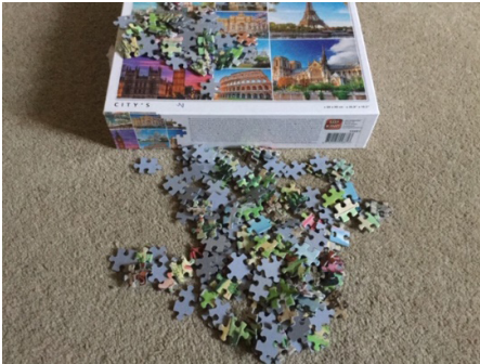
Figure 3 Mess that produces a required picture

It is the type of mess that challenges you to create something new, where there is a range of known building blocks but what can be created from these is, as yet, unknown. It is both familiar and unfamiliar at the same time.